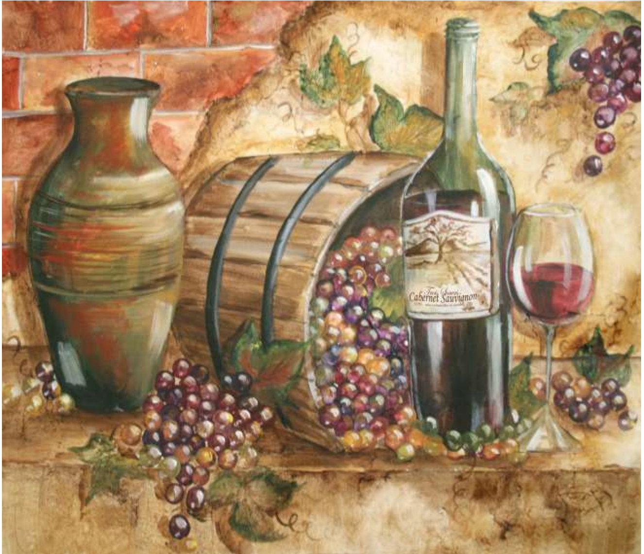
A Promise Vintage