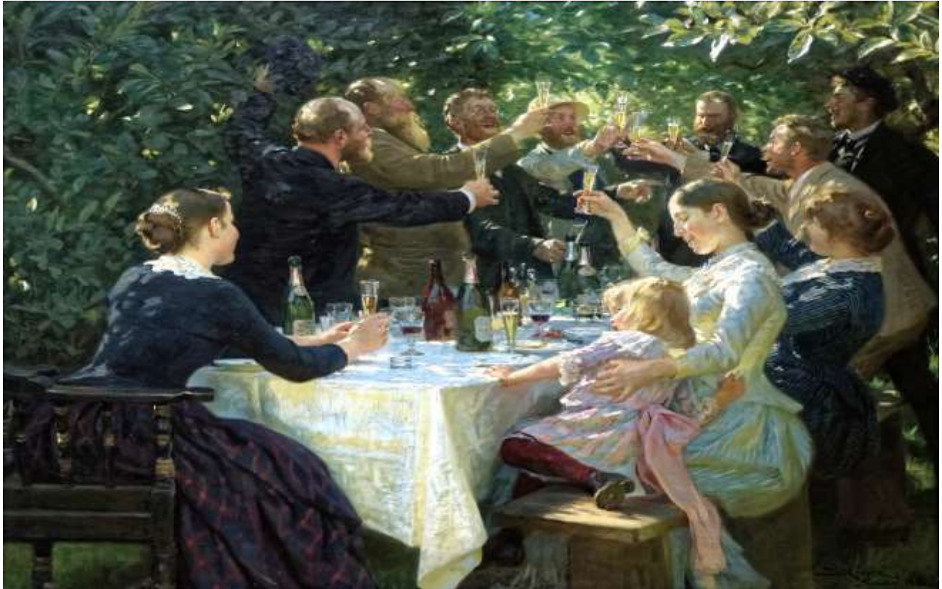
Hip Hip Hurrah ! Artist's Party, Skagen

Clearly not just the physical effect of the alcohol lurking behind the bubbles. In most circumstances even the sound of a cork popping lightens the mood and provokes an immediate sense of expectation. With a flute of Champagne in hand, the young feel wisely witty, the old feel young and everything is better looking.